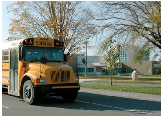
The Green Bank Science Center.

Make the Green Bank Science Center your home-base and add additional attractions to the itinerary. Youth and school groups visiting the Green Bank Science Center may utilize the NRAO Bunk House. The new 60 unit dormitory is affordable and comfortable. Kids bring their own linens or sleeping bags. The cost per person is approximately $5.00/night. Chaperones stay in separate but attached bedrooms. Meal options are also available. Bus driver accommodations may be arranged on-site or nearby.