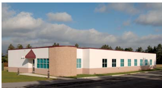
NRAO bunk house for overnight student guests.

We'll help you organize forays to area attractions and other educational destinations. Just let us know what you'd like to do. Here are some suggestions!