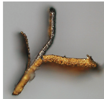
Fig. 2. De-lamination of the gold and nickel after protracted immersion in ammonium persulfate etchant.

To reduce unnecessary exposure of the probes to the etchant, the probes were covered with G-wax (glycol phthalate, MP 100°C) during etching. The following procedure was used: