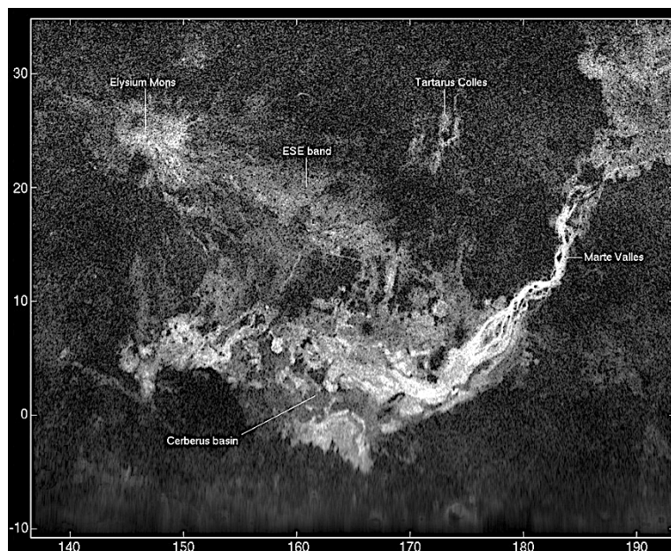
Arecibo 12.6-cm radar image of lava flows and channel deposits in the Elysium region of Mars. Data from Harmon et al. [2012]. The brightest features running from right to lower center are rough lava flows that fill more ancient water-carved channels.

The same long-code technique has been successfully applied for Mercury S-band imaging [Harmon et al., 2011]. Potential follow-on observations might focus on acquiring enough looks to achieve useful SC echoes from the broad Mercury plains regions for comparison to similar features on the Moon, comparable to the work done for rayed craters [Neish et al., 2013]. It would also help to constrain the distribution of volatiles in Mercury's polar regions [Chabot et al., 2013]. Studies of this type are particularly timely, given the new remote sensing data available from the MESSENGER mission, and the upcoming Bepi-Colombo mission. Note that neither spacecraft had a radar instrument, nor are there plans for one in the future.